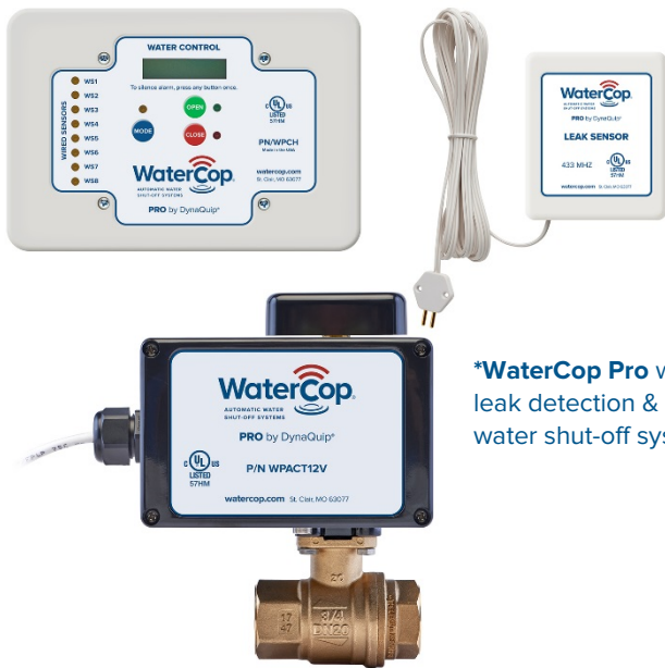
*WaterCop Pro whole-home leak detection & automatic water shut-off system.

More and more insurance providers now offer discounts for installing a leak-detection and automatic water shut-off system. Policies differ from one provider to another, but it is commonly required that the system actively monitor for leaks and automatically shut off the water to the whole house in the event a leak is detected. WaterCop not only monitors and stops leaks, it sends a notice to your phone, tablet, or security system.